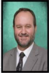
A ABBOTT Principal